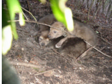
Red Wolf Puppies

The captive pups were then fostered into a wild wolf den containing two pups of identical age. Last year, this adult female raised six pups and we feel she can easily handle a litter of four.